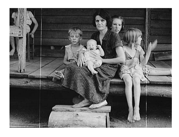
Cotton sharecropper family in Macon, County, GA, 1937.

If you cannot find interesting photos from your county, look for one nearby.